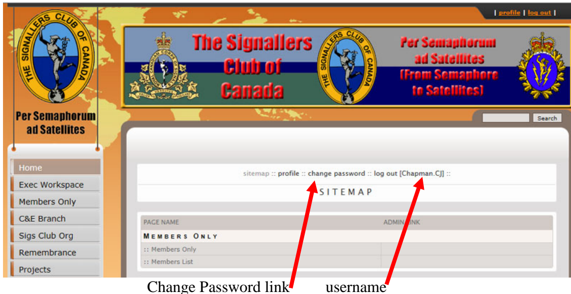
Figure 2. Sitemap - Change Password Link

Click on the change password link and the Change Password page will display. The Title will read LOG OUT but it is actually Change Password